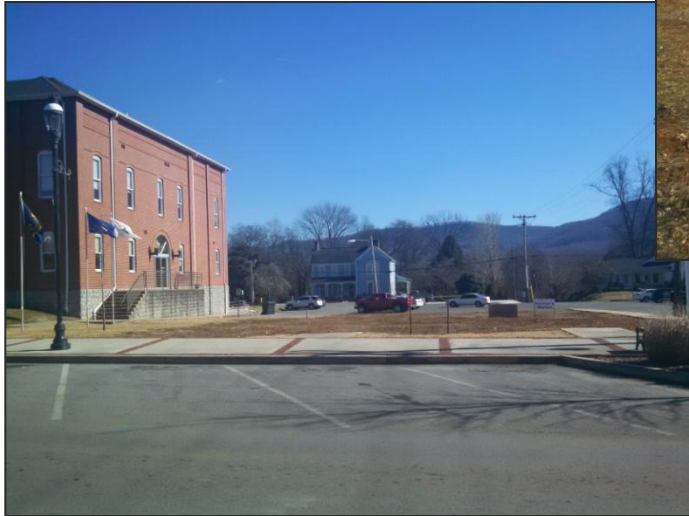
Future Site of Farmer's Market